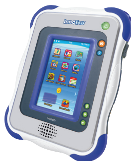
Launched in 2011, the InnoTab is a multi-function educational tablet for children aged 4-9 years old.