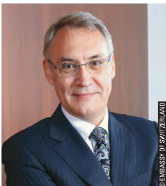
Jean-François Paroz, Ambassador of Switzerland to Japan

Jean-François Paroz, ambassador, Embassy of Switzerland in Japan: "In spite of a population of just 8.5 million and a territory about the size of Kyushu, Switzerland may well be called an economic powerhouse. It ranks among the world's top 20 economies in terms of gross domestic product, as well as of merchandise and services trade, and is among the top 10 when it comes to foreign direct investment. Switzerland regularly occupies top spots in international rankings such as the