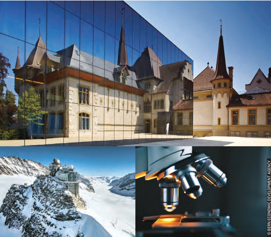
Bern, is a high-technology hub driven by innovation surrounded by unrivaled natural beauty and cultural attractions.

There are also numerous knowledge and technology transfer platforms in Switzerland, including the Switzerland Innovation Park Biel/Bienne, the Swiss Smart Factory and the Swiss Institute for Translational and Entrepreneurial Medicine (sitem-insel), where the latest developments and findings in